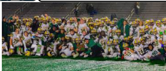
2024 DIVISION ONE REGION ONE CHAMPIONS

Oct. 24, 7:00 p.m. @ Akron Hoban Dowed Field