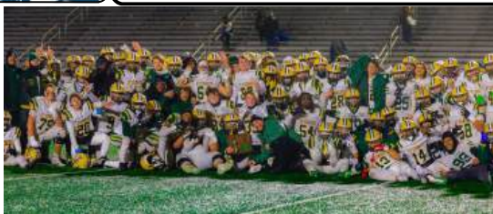
2024 DIVISION ONE REGION ONE CHAMPIONS

Oct. 24, 7:00 p.m. @ Akron Hoban Dowed Field