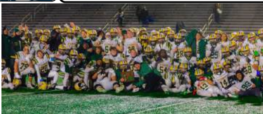
2024 DIVISION ONE REGION ONE CHAMPIONS

Oct. 24, 7:00 p.m. @ Akron Hoban Dowed Field