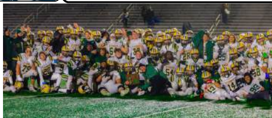
2024 DIVISION ONE REGION ONE CHAMPIONS

Oct. 24, 7:00 p.m. @ Akron Hoban Dowed Field